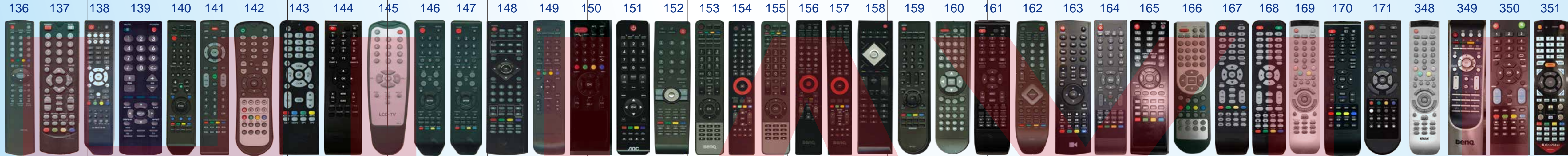
136 HOB331 AKAI A4001032 137 HOB353 KM128 138 HOB368 S5 S6 S7 S8 S9 139 LCD-2318 140 HOD142 HOD142 141 HOD148 VT-L9A11 142 HSR553 CYFROWY POLSAT 143 HSR585 IPM PLATFORM 144 Singer LCD TV 901-7650-31SG1G 145 LCD TV FU-1 146 LCT 01 147 LCT 02 148 148 149 HOB393 1253 150 12-17-2011_001 151 AOC-01 152 AOC-02 153 BENQ-01 154 BENQ-02 155 BENQ-03 156 BENQ-04 157 BENQ-05 158 VIZIO 159 NEC RP-42L1 160 SANYO JXPYR 161 ROLSEN RL-32L700U 162 POLYTRON 81F579 163 SAM_2446 164 SAM_2443 165 SAM_2457 166 lcd tv 167 AKAI A3001012 168 AKAI CX-507 169 BBK EN-31907 170 CHANGHONG GHK-4421A 171 E-RCU-015 348 BBK_EN-31907 349 Benq 350 china 351 EcoStar 2