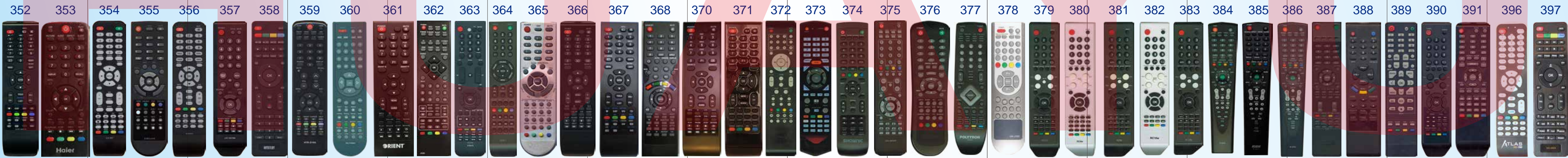
352 HCH067-CHANGHONG GHK-4421A 353 Heir 2 354 HOB477 AKAI CX-507 355 HOB478 E-RCU-015 356 HOB479 AKAI A3001012 357 HOB484 Akai LTA-15A15M 358 HOB489 MESTERY LCD LED TV NEW 359 HOB490 Polar HTR-D18A 360 HOB491 Polar 55 LTV6002 361 Orient 362 PROTON 2 363 POLYTRON EN-31618P 81E878 364 HOB864 SNOWA T202-1 365 HOB455 ELECTRON T-81100 366 HOB457 RL-32L700U 3D 367 HOB464 BRAVIS LED2868 HQ 368 HOB465 DIGITAL DLE-4011 370 HOB46 LUXEON LED3213 HQ 371 ORION EP 22 LCD2623 372 HOB493 HAIER 373 HOB494 SUPRA 374 HOB498 SHOWNIC 375 LEA-19V07P 376 IZUMI 377 81F579 378 ORION OR-LCD2 379 FUSION RC21b 380 SUPRA RC6w 381 SUPRA RC8b 382 SUPRA RC10w 383 SUPRA RC18b 384 RC-LEM100 385 BBK RC-LEM101 386 BBK RC-LEM100 387 IZUMI TL26H211B 388 JAC 389 SKY LINE 390 TRUMAN 391 union tech 396 ATLAS HD100 397 HOB688 ATLS HD-200S